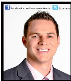
Dan Amarante, Fox 61