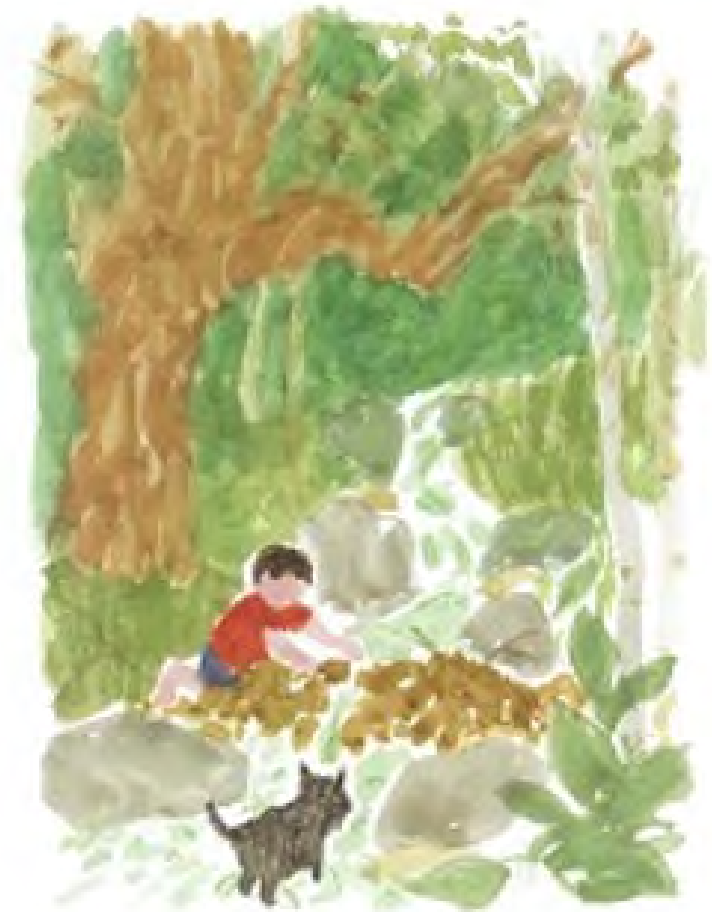
STEVENSON, JAMES. FUN/ NO FUN. NEW YORK: GREENWILLOW BOOKS, 1994.

images. Stevenson was able to take his own experiences; playing in the woods, making snowmen, swimming with his family, and turn them into meaningful images which illustrate stories that we still read today. Using simple materials, colored pencils, and watercolors, Stevenson illustrated the many seasons of childhood pleasures.