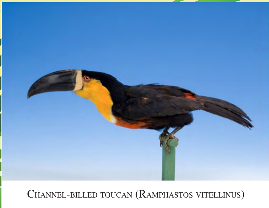
CHANNEL-BILLED TOUCAN (RAMPHASTOS VITELLINUS)

What is it about the Amazon Rainforest that continually intrigues us? The Bruce Museum's upcoming exhibition, "Amazon: Beauty, Destruction, Hope" from June 19 - October 10, 2021, seeks to explore the essence of what makes the Amazon a perennial source of fascination. The Amazon Rainforest is a special place; home to 1 out of every 10 known species on the planet, these verdant forests deserve and need our protection and understanding. Getting to know the plants and animals of the rainforest, and how the many indigenous peoples who live there have found ways to live in balance with their environment inspires us all to find balance with our own ecosystems.