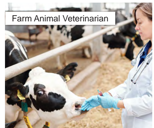
Farm Animal Veterinarian